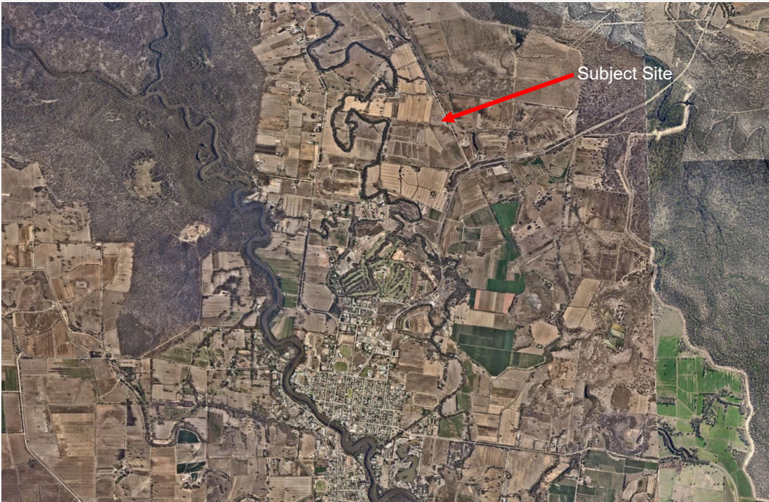
Figure 2 – Context Map